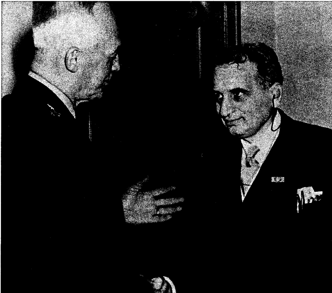
Figure 1. Five Star General Hap Arnold thanks Dr. Theodore von Kármán following the completion of the first Airpower S&T report. The report, Toward New Horizons , was submitted on 15 December 1945.